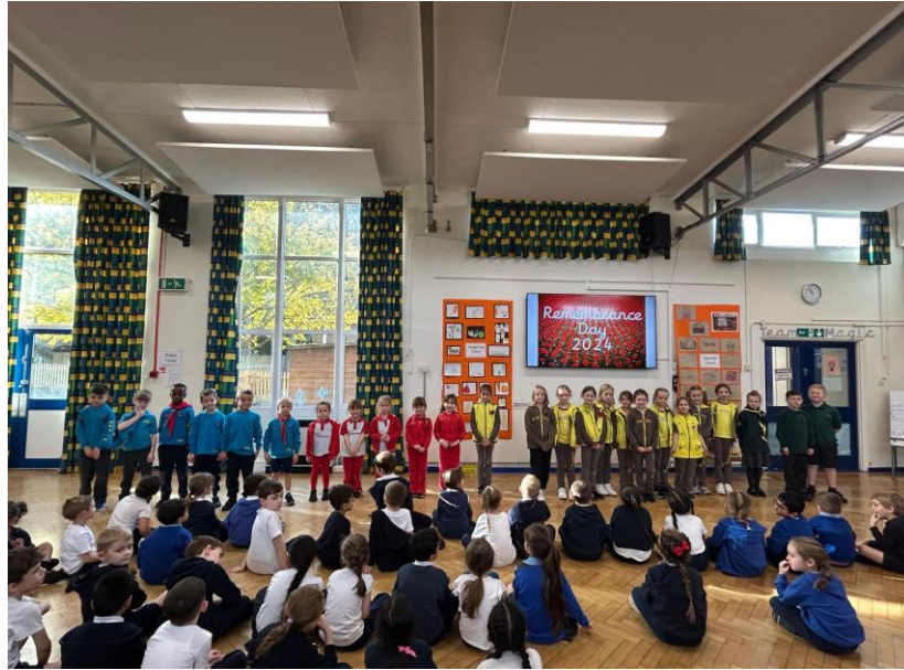
A photo from our Remembrance assembly with children across the school wearing their rainbows, brownie, cubs or beavers' uniforms. Robin Class observing the 2 minutes silence outside whilst listening to the cannons from Windsor castle.