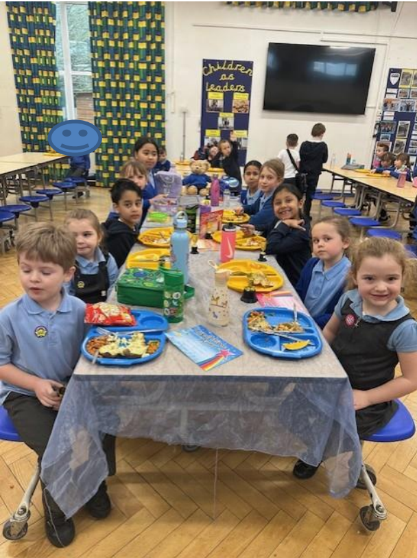
Congratulations to our Top Table 29/1/2025